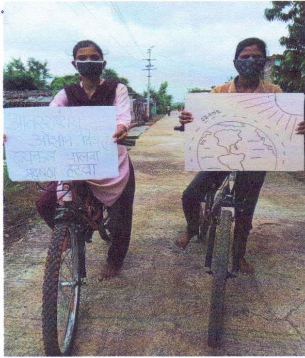
Ozone Awareness by using Bicycle