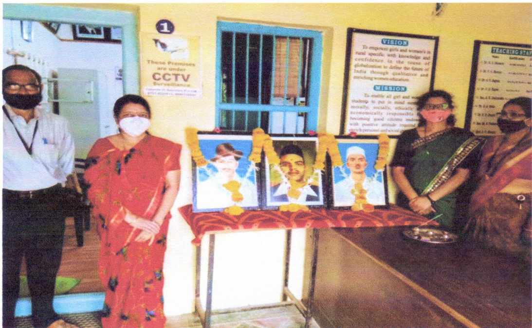
Tribute paid to Bhagat Singh , Raj Guru and Sukh Dev on 23th March 2021