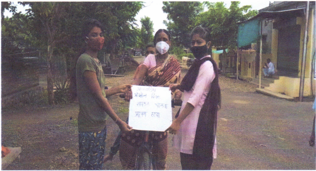
Ozone Awareness by using Bicycle