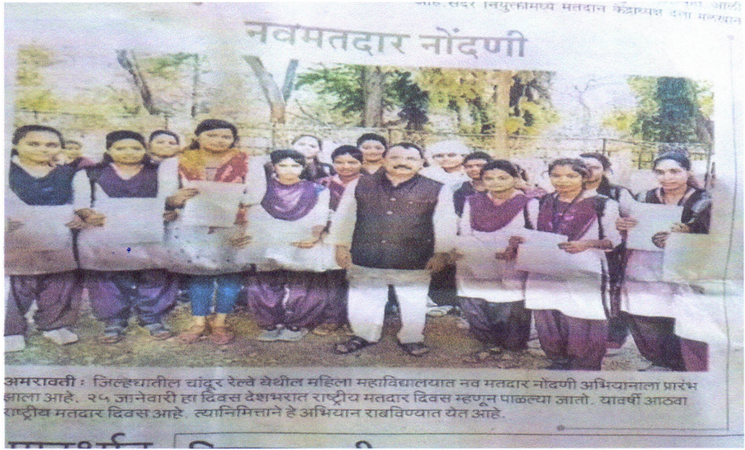
New Voters Enrolment