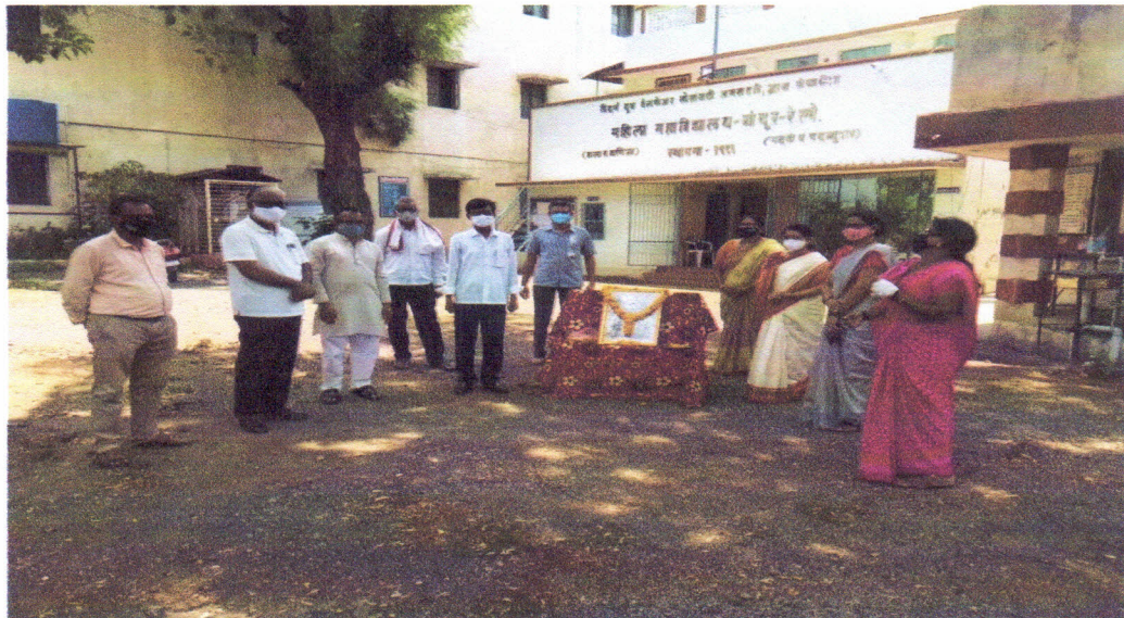
Tribute Paid to Chatrapati Shivaji Maharaj 19 th February 2021