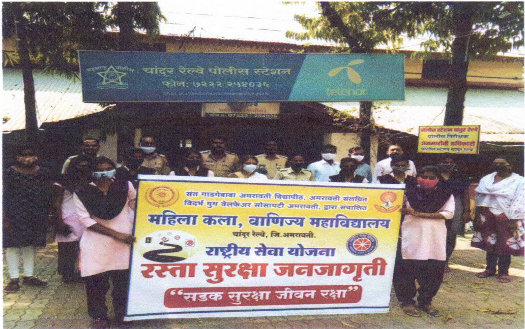
Road Traffic & Security