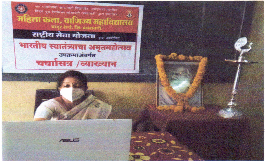
Azadi ka Amrut Mohotsav special speech