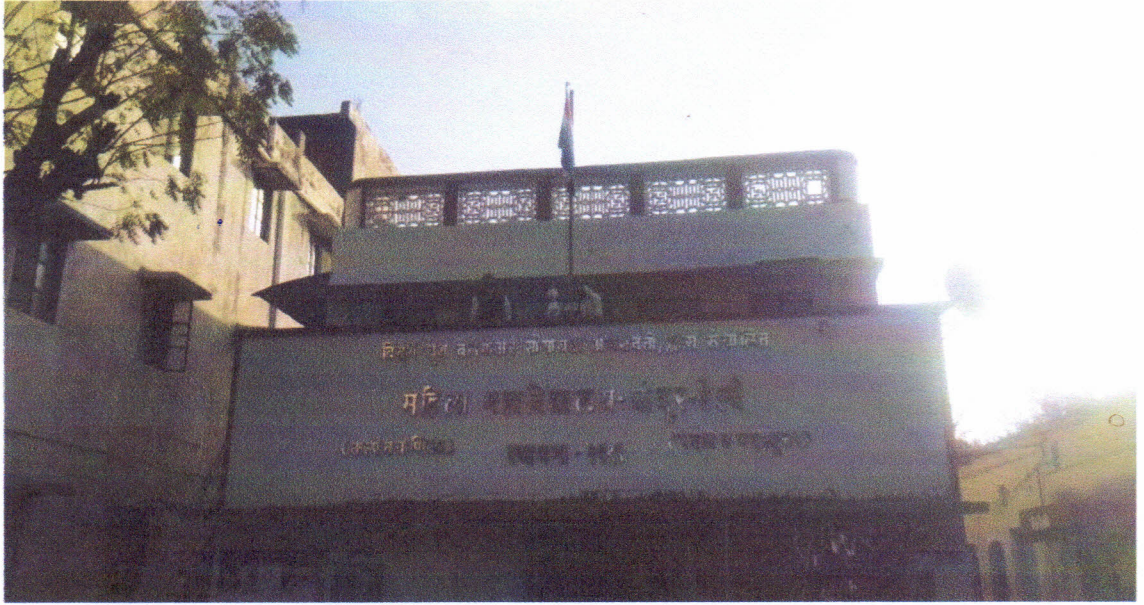
Flag Hosting on 15 th August 2020