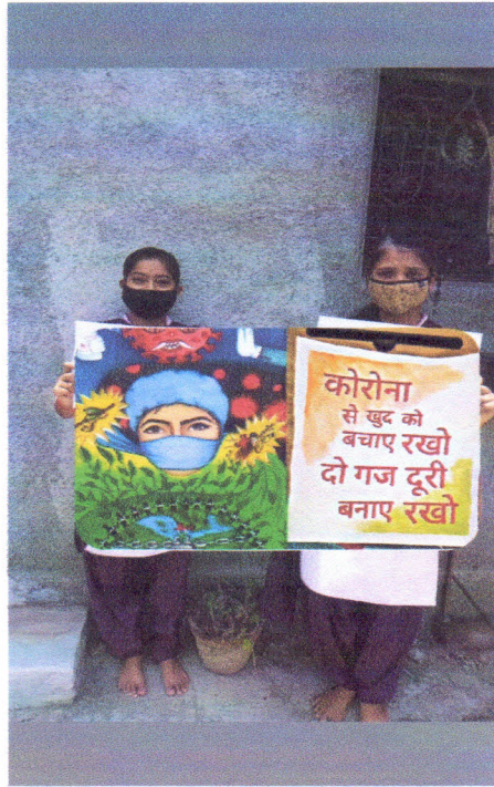
Health Awareness Painting & Slogan Competitions in Pandemic