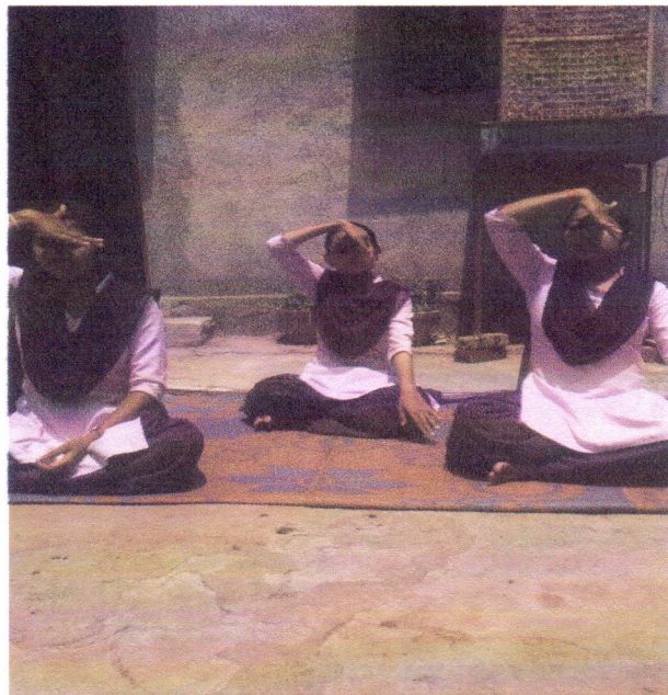
Importance of Yoga