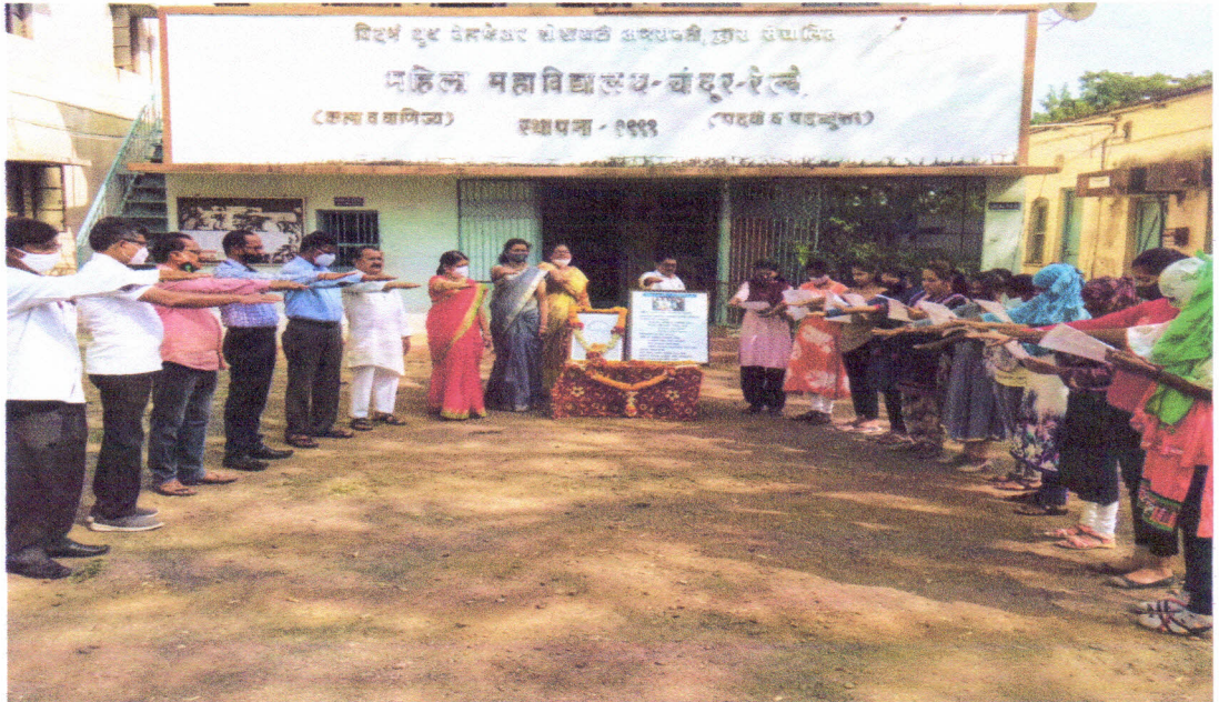
Reading of Constitution on 26 th November 2020