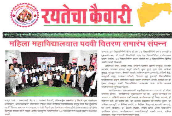
Figure 1, News Paper cutting of Convocation Ceremony

while gender neutrality and gender equity are practices and ways of thinking that help in achieving the goal. Gender parity, which is used to measure gender balance in a given situation, can aid in achieving gender equality but is not the goal in and of itself. Gender equality is more than equal representation, it is strongly tied to women's rights, and often requires policy changes. The global movement for gender equality has not incorporated the proposition of genders besides women and men, or gender identities outside of the gender binary. UNICEF says gender equality “means that women and men, and girls and boys, enjoy the same rights, resources, opportunities and protections. It does not require that girls and boys, or women and men, be the same, or that they be treated exactly alike. On a global scale, achieving gender equality also requires eliminating harmful practices against women and girls, including sex trafficking, femicide, wartime sexual violence, gender wage gap,[2] and other oppression tactics.