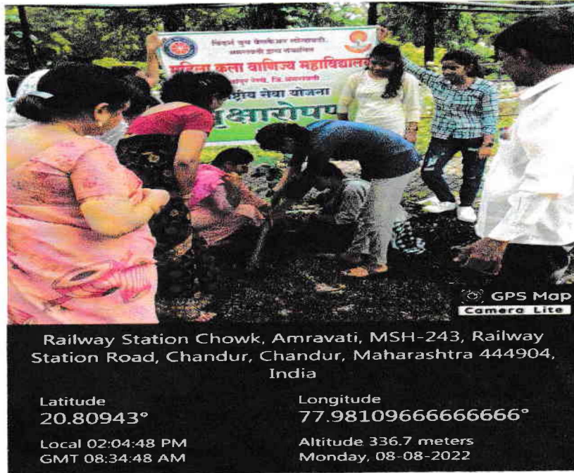
Figure 4, Tree Plantation