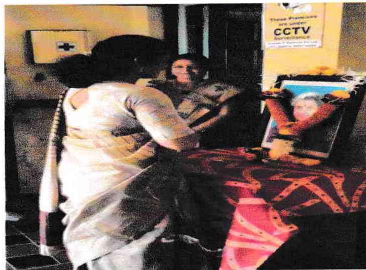
Figure 5, Celebration of Birth Anniversary of Indra Gandhi