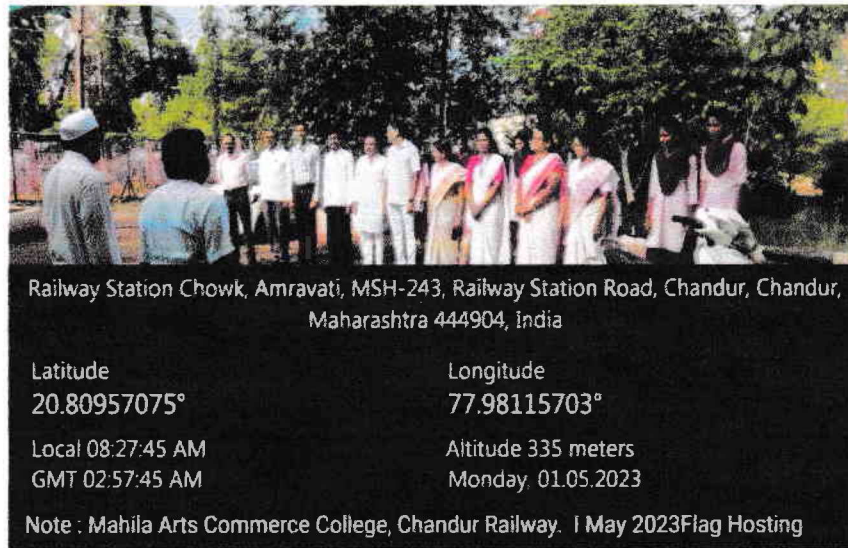
Figure 3, Celebration of Maharashtra Day